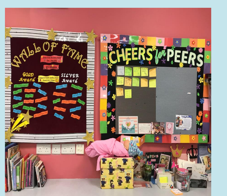
"Wall Of Fame" & "Thank You" Board

The following were implemented over the span of 8 months: