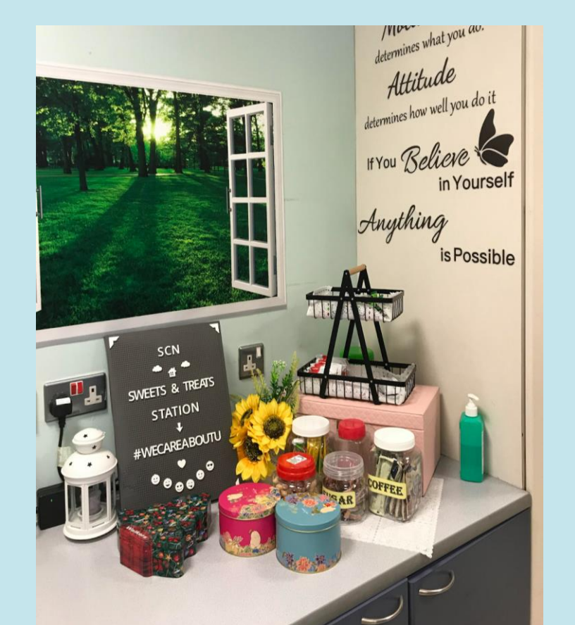
Energy Booster Corner