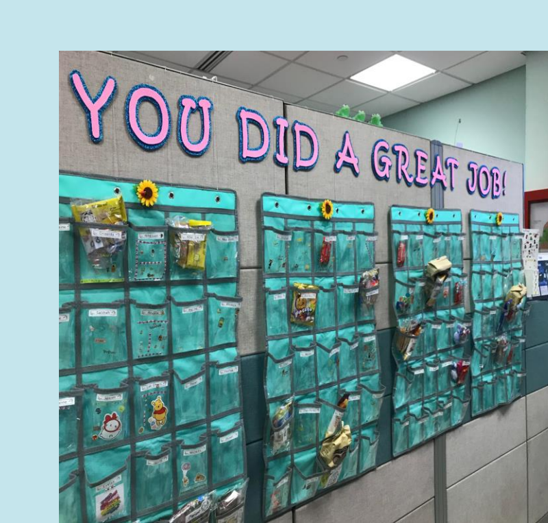
Encouragement goodies for jobs well done by staff

Nurses were given an electronic self-administered survey after the launch of these activities. Five close-ended questions using 5 point Likert scale were disseminated to the nurses indicating "Strongly Disagree"(1) to "Strongly Agree" (5).