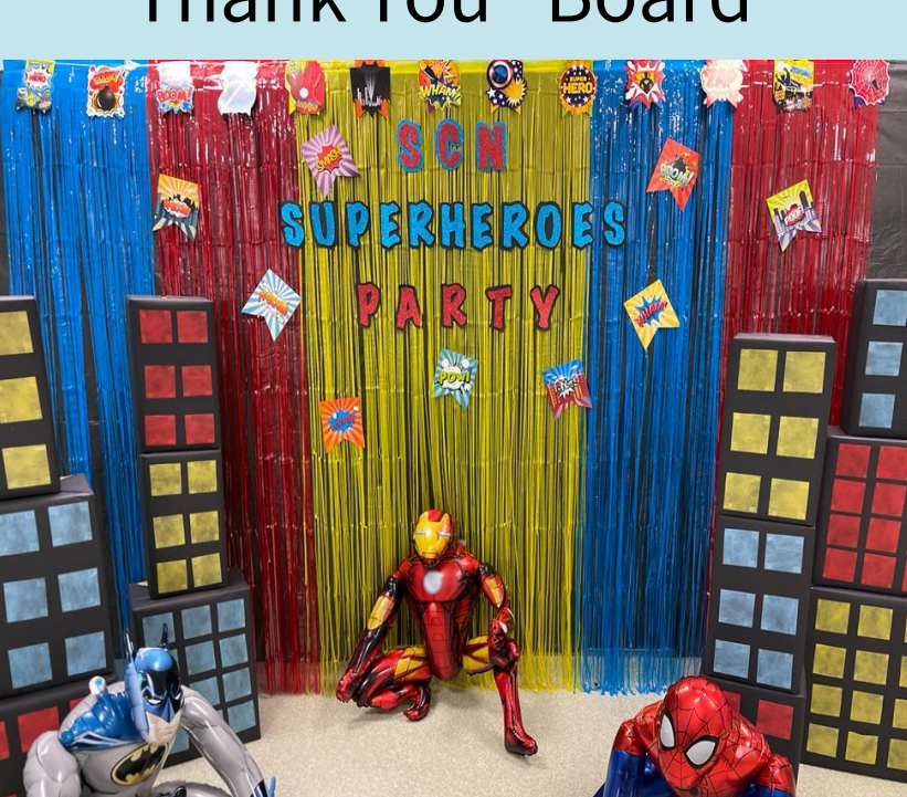
Year End Themed Party