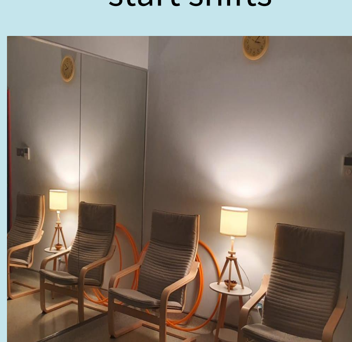
Creation of a meditative space using "Joyful Workplace Award" fund